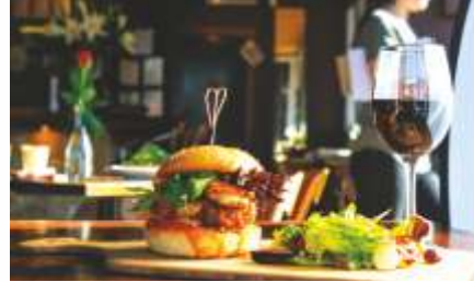
FOOD & DELICACIES