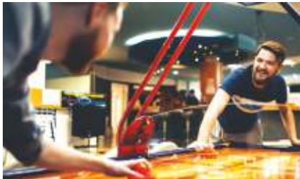
ENTERTAINMENT & JOY